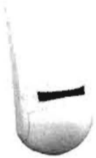
PIR Motion Detector