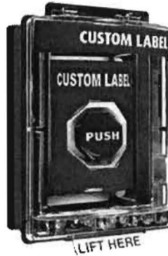
Mushroom Button with Weather Resistant Cover